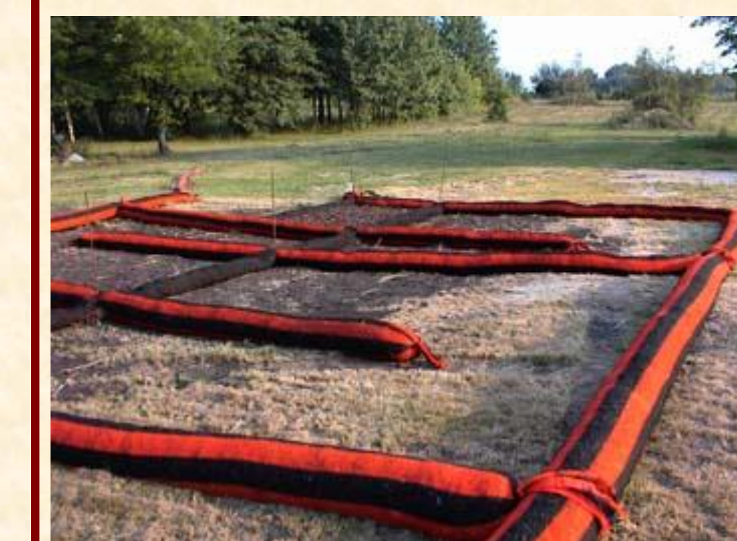
Example of FilterCell™ for Pollutant Filtration