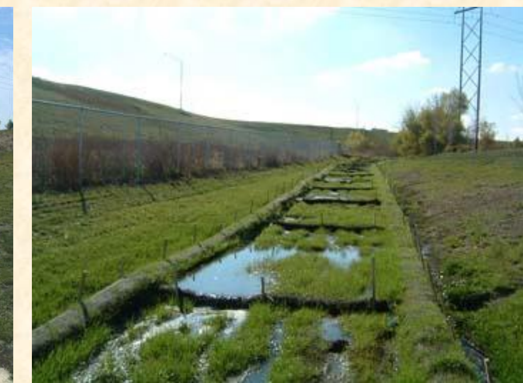
Treatment of Field Drainage Area Runoff