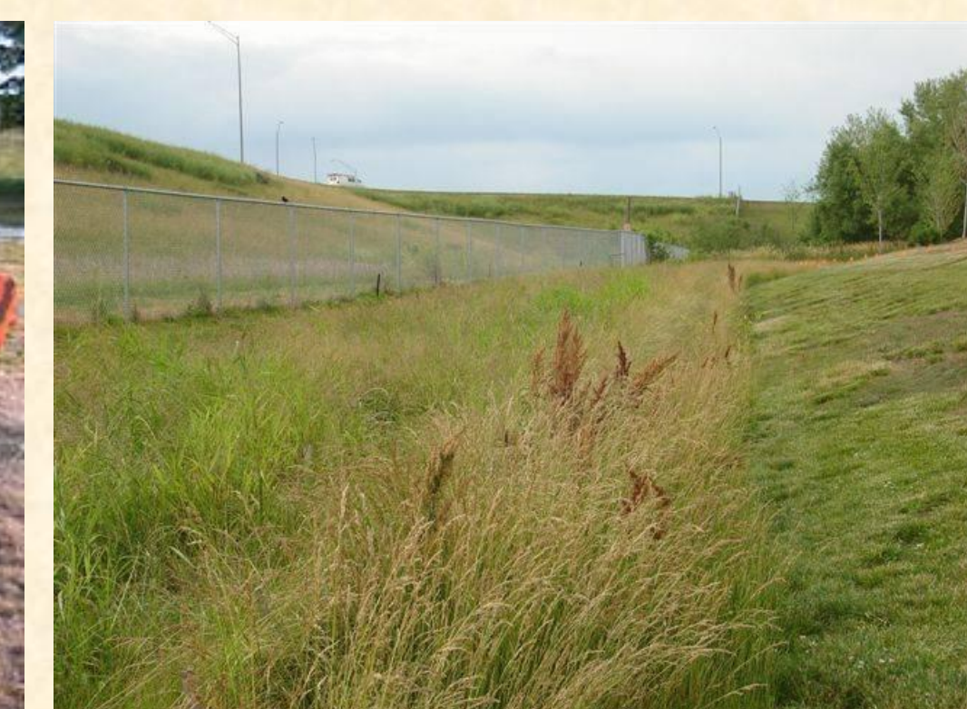
Fully Vegetated FilterCell™