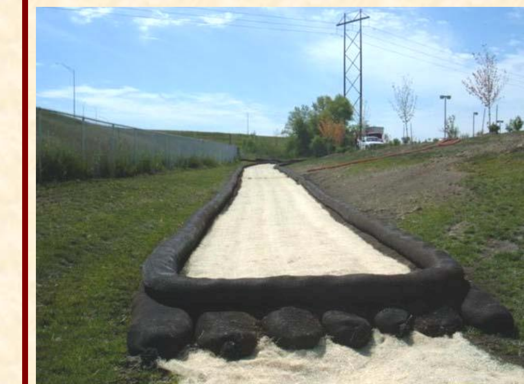
Base Installation of FilterCell™